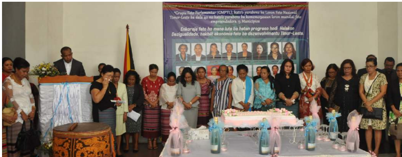
The Timor-Leste Parliament celebrated the 41st year of the Timorese National Women's Day, Dili, November 2016

DILI, TIMOR-LESTE - On 15 November 2016, the Grupo das Mulheres Parlamentares de Timor-Leste (GMPLT of Women's Parliamentary Caucus) celebrated the 41st year of the Timorese National Women's Day in the Parliament under the theme "Stop Gender Inequality, Women's Economic Empowerment for the Timor-Leste Development." Among the estimated 700 participants were Members of Parliament, government members, parliamentary staff, CSOs, women entrepreneurs and students.