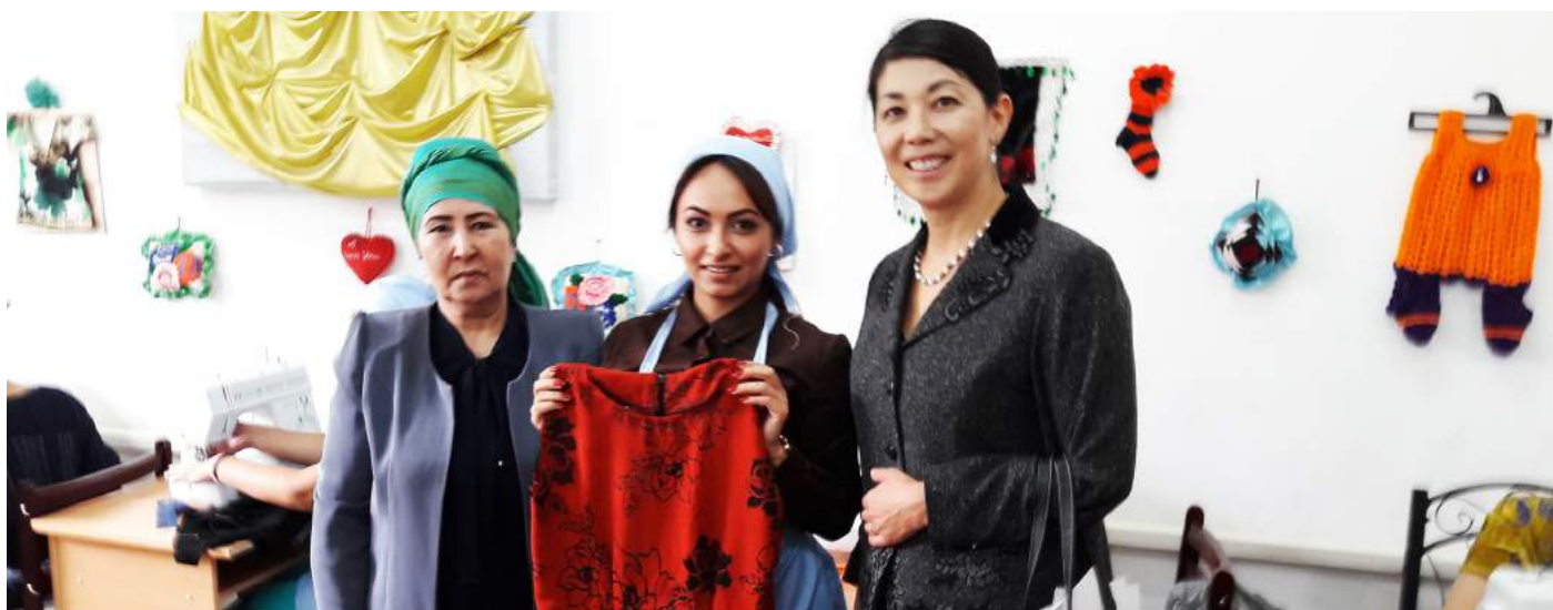
Vocational training courses are offered at the Ministry of Labour not only to Tajik citizens but also selected foreign students under the special international cooperation programme. An Afghan student is flanked by a Tajik instructor and AFPPD Executive Director, Dushanbe, October 2016