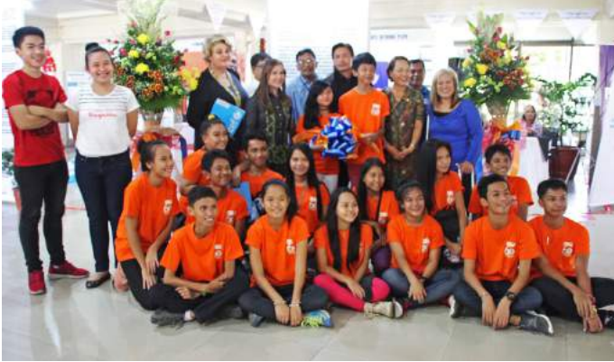
Celebration of Children's Month at the House of Representatives in the Philippines, Quezon City, November 2016

QUEZON CITY, PHILIPPINES - The Child Rights Network (CRN), through its convenor, the Philippine Legislators Committee on Population and Development (PLCPD), organized a series of activities in celebration of Children's Month at the House of Representatives (HOR) on November 21-23.