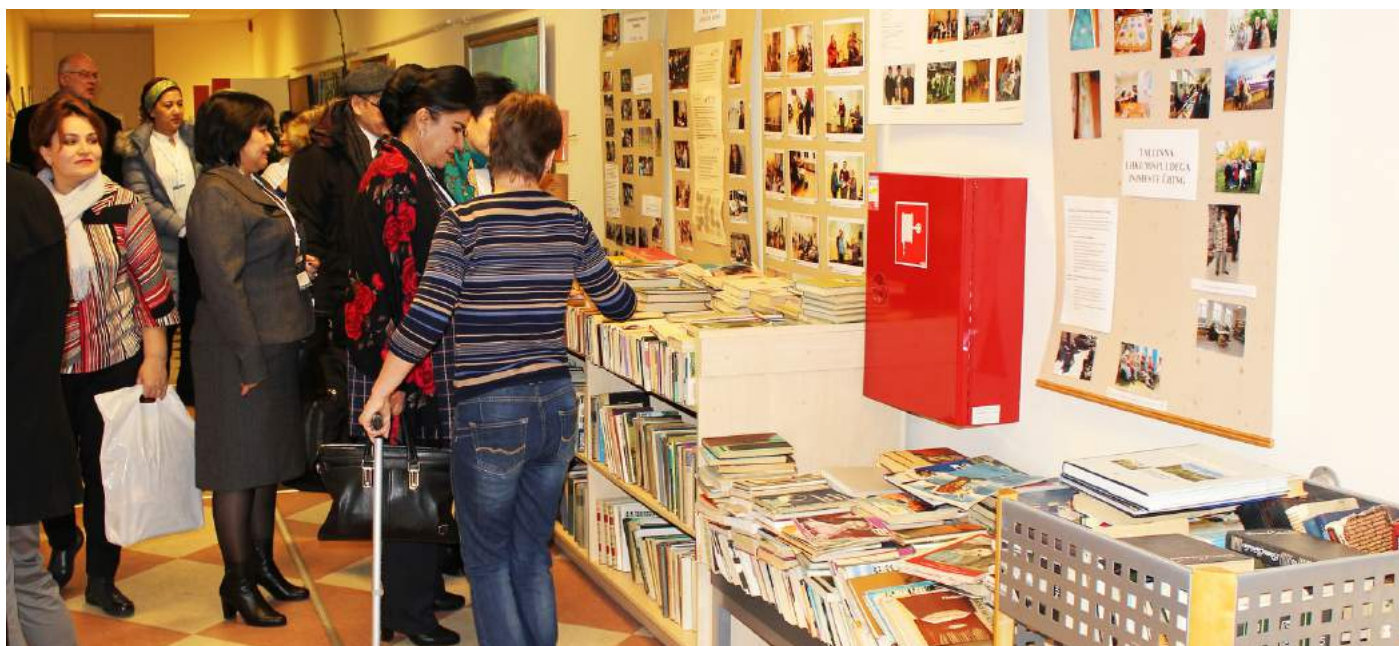
The Central Asian Parliamentary Delegation visited two youth clinics as part of the study tour organized by AFPPD, Tallinn, December 2016

TALLINN, ESTONIA – On December 1-3, AFPPD organized a study tour for the Central Asian Parliamentary Delegation in Tallinn, Estonia in collaboration with the Estonian Sexual Health Association. The delegation comprised of Members of Parliament from Kyrgyzstan and Tajikistan, parliamentary staff, as well as representatives of the International Planned Parenthood Federation (IPPF) member associations from Kazakhstan (Kazakhstan Association on Sexual and Reproductive Health) and Kyrgyzstan (Reproductive Health Alliance of Kyrgyzstan).