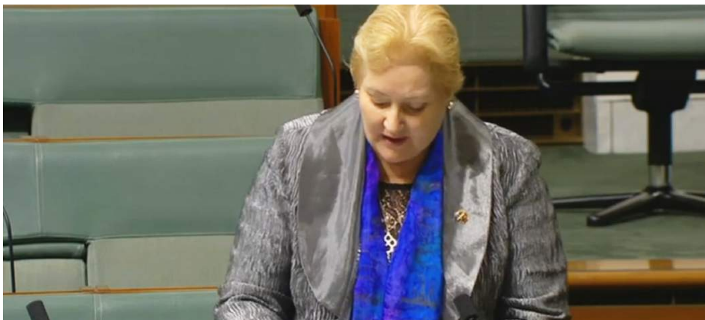
Hon. Ms. Ann Sudmalis, MP Australia and Vice-Chairperson of AFPPD, delivered a speech at the General Meeting of the Australian Parliamentary Group on Population and Development, Gilmore, November 2016

GILMORE, AUSTRALIA - On November 9, Hon. Ms. Ann Sudmalis, Member of Parliament from Australia and Vice-Chairperson of the Asian Forum of Parliamentarians on Population and Development (AFPPD), delivered a speech at the General Meeting of the Australian Parliamentary Group on Population and Development (APGPD). This also marked her formal election as Chairperson of the APGPD. In her speech, Hon. Ms. Sudmalis shared some insights on gender equality and the role of parliamentarians as catalysts of change from AFPPD's 11th Women Ministers and Parliamentarians Conference. She also chaired the session on Women's Economic Participation during this conference. The following is an excerpt from Ms. Sudmalis' speech where she spoke about her work in Australia and her work with AFPPD: