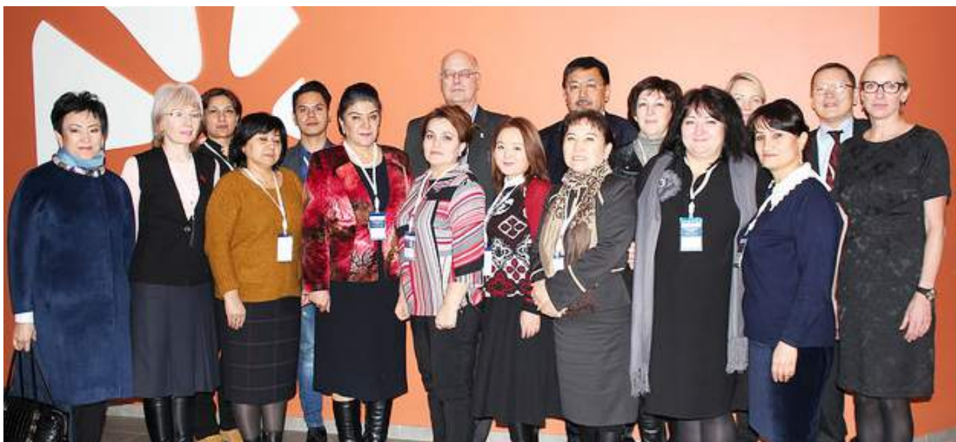
Participants at the Study Tour on Youth Sexual and Reproductive Health Policies included Members of Parliament from Kyrgyzstan and Tajikistan, Tallinn, December 2016