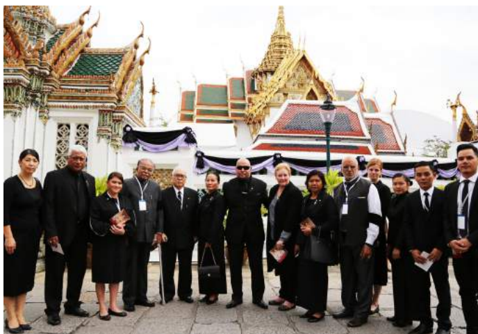
After the 81st Executive Committee meeting, the AFPPD Executive Members visited the Grand Palace to pay respect to His Majesty King Bhumibol Adulyadej, Bangkok, November 2016