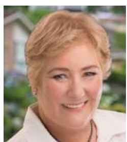
Hon. Ms. Ann Sudmalis Member of Parliament, Australia

Hon. Mr. S.B. Dissanayake is a member of the United People's Freedom Alliance (UPFA) and Minister of Social Empowerment and Welfare. Hon. Mr. Dissanayake is a member of the Committee of Public Accounts. His political career includes being: member of the Communist Party in Sri Lanka from 1970 to 1979; President of the Inter-University Students' Federation from 1972 to 1974; President of the Student Council of the Vidyodaya University from 1972 to 1974; and President of the Lanka National Student Council from 1974 to 1976.