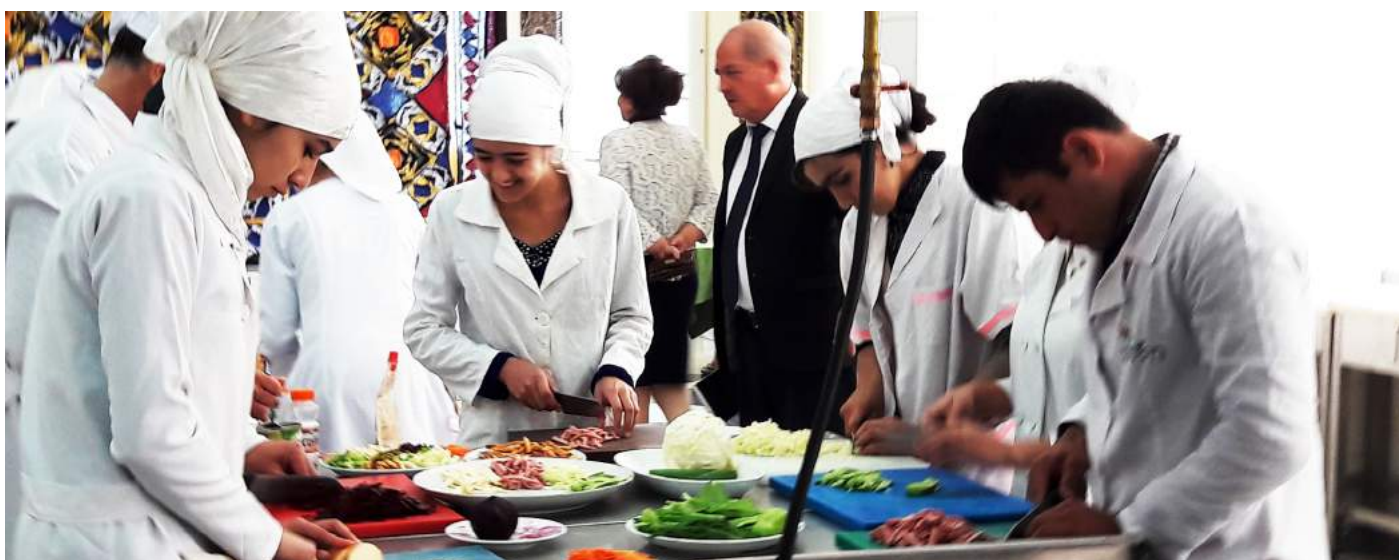
A cooking class at the State Labor and Employment Agency as part of AFPPD's field visit, Dushanbe, October 2016