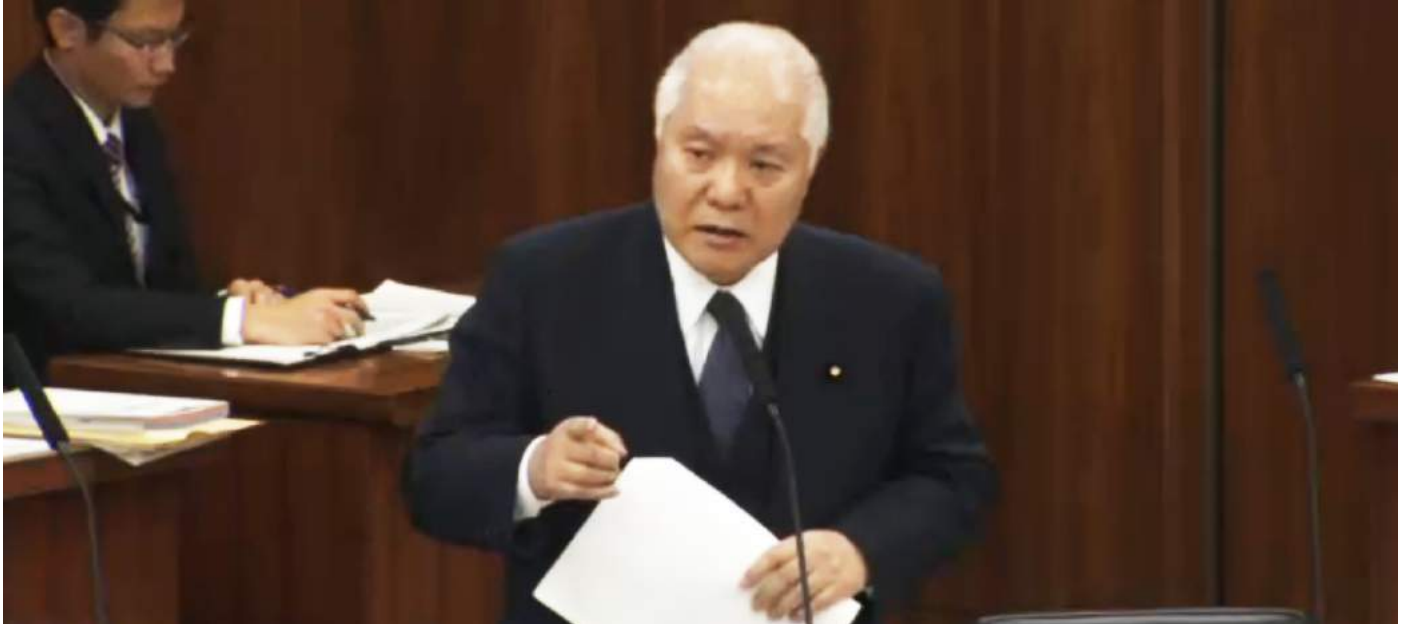
Hon. Professor Keizo Takemi, Member of House of Councillors and Chair of AFPPD, raised questions concerning health commitments by the G7 Ise-Shima Leaders to the Minister of Health, Labor and Welfare, Tokyo, November 2016

TOKYO, JAPAN - As the Chairperson of the Asian Forum of Parliamentarians on Population and Development (AFPPD), Hon. Professor Keizo Takemi successfully concluded the Global Conference of Parliamentarians on Population and Development toward the 2016 G7 Ise-Shima Summit (G7 GCPPD) in Tokyo on April 26-27, 2016. The GCPPD was instrumental in soliciting the world leaders' collective commitment; the G7 Leaders Declaration reflected extensively the GCPPD Declaration and Recommendations in AFPPD's strategic priority areas, which include universal health coverage and infectious disease risk management as a part of human security.