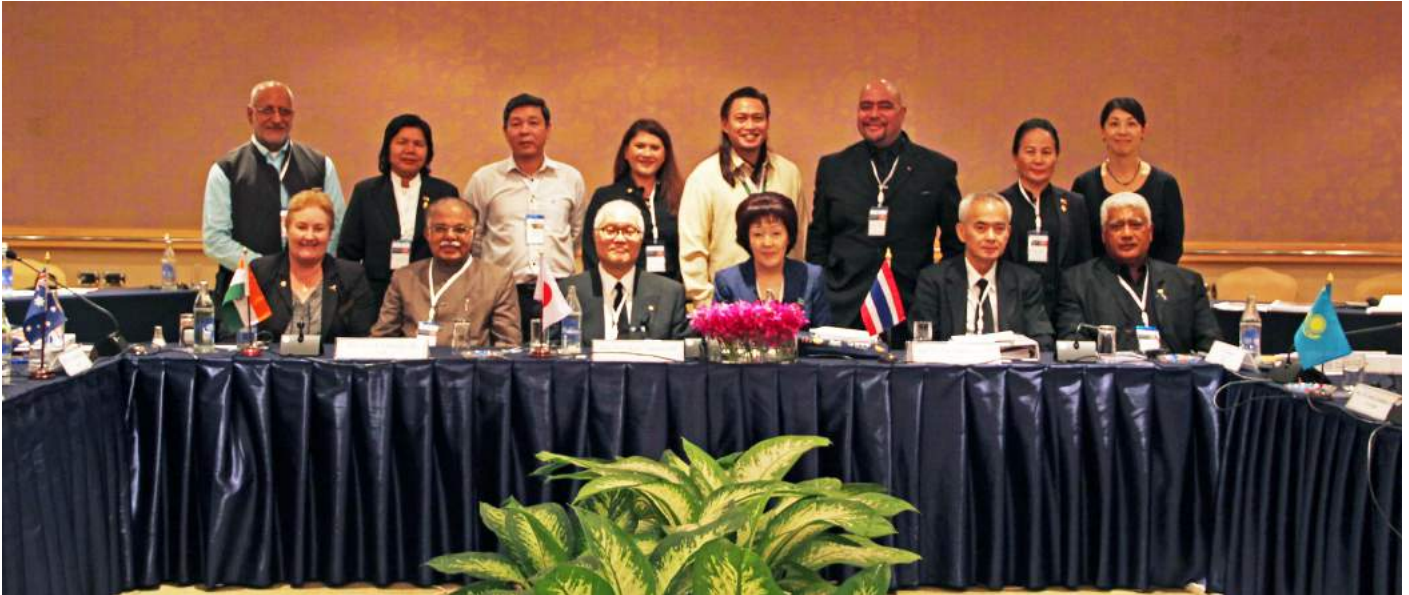
AFPPD held its 81st Executive Committee Meeting, appointing three new Executive Members and approving the establishment of a new National Committee in Sri Lanka, Bangkok, November 2016