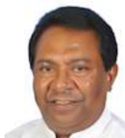
Hon. Mr. S.B. Dissanayake Member of Parliament, Sri Lanka Minister of Social Empowerment and Welfare

Hon. Mr. S.B. Dissanayake is a member of the United People's Freedom Alliance (UPFA) and Minister of Social Empowerment and Welfare. Hon. Mr. Dissanayake is a member of the Committee of Public Accounts. His political career includes being: member of the Communist Party in Sri Lanka from 1970 to 1979; President of the Inter-University Students' Federation from 1972 to 1974; President of the Student Council of the Vidyodaya University from 1972 to 1974; and President of the Lanka National Student Council from 1974 to 1976.