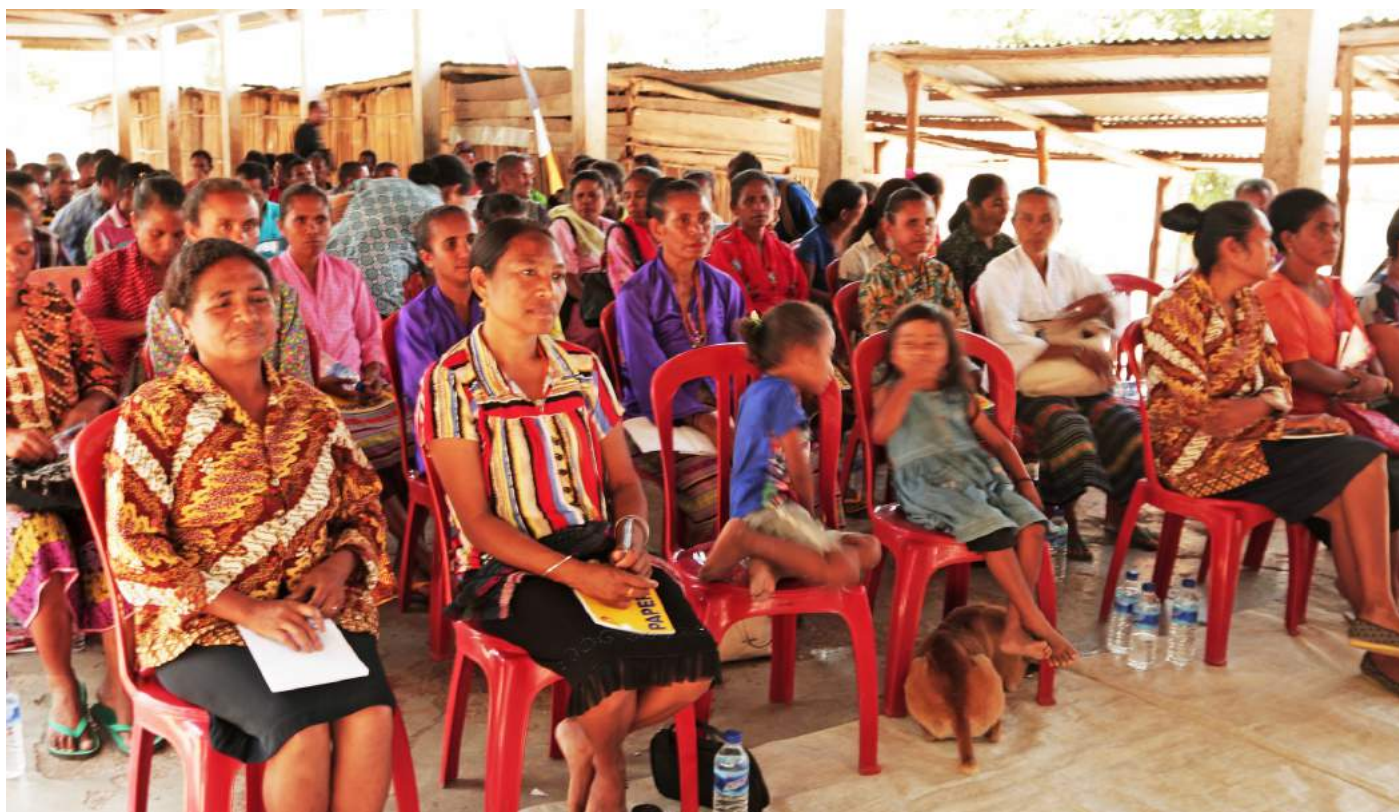
Over 200 participants at the dialogue on "Promotion of Women's Economic Empowerment in Rural Areas" organized by GMPLT, Oecusse-Ambeno, October 2016