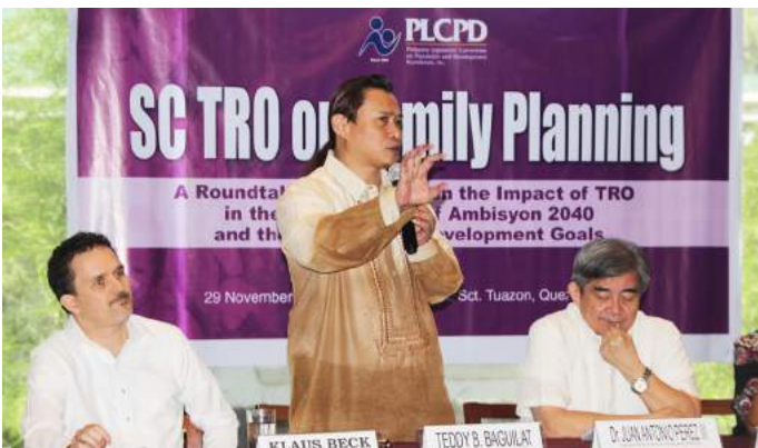
Hon. Rep. Teddy Baguilat, PLCPD Chairperson for the House of Representatives and AFPPD Vice-Chair, raised the need to increase public discussion on the temporary restraining order, Quezon City, November 2016

The Philippine Legislators' Committee on Population and Development (PLCPD) facilitated a roundtable discussion on the impact of the Supreme Court's (SC) decision on the Temporary Restraining Order (TRO) on the achievement of Ambisyon 2040 and the Sustainable Development Goals (SDGs) on November 29.