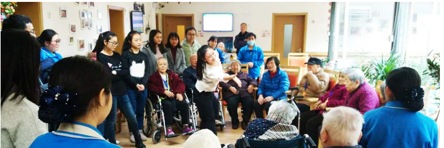
As part of the International Conference of Population Ageing, participants including AFPPD Executive Director visited the Cuncaochunhui Home for the Aged, Beijing, December 2016