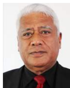
Hon. Lord Tu'ivakano Speaker of Parliament, Tonga

has been a member of the Liberal Party since 2006 and is currently a member of the Coalition Policy Committees for Education, Defence and Veterans Affairs, Infrastructure and Regional Development. Apart from being an advocate to improve local projects, she has the parliamentary responsibilities as a Committee Member on the Parliamentary Education Office Advisory Committee, Joint Standing Committees of Education and Employment, and the Standing Health Coommittee.