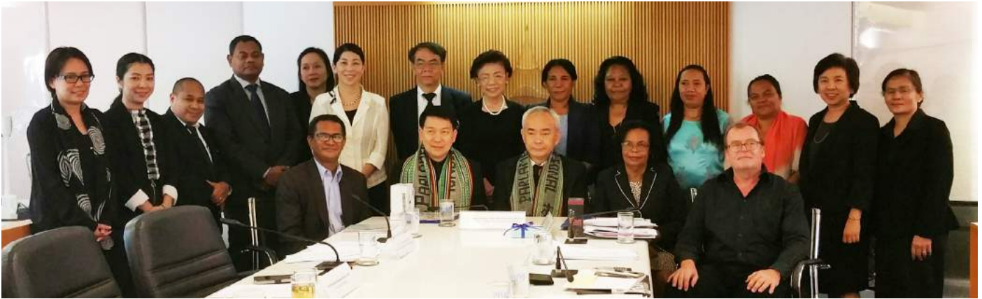
The Timor-Leste delegation at the Rajvithi Home for Girls as part of the study tour organized by AFPPD and the Ministries in Thailand, Bangkok, November 2016

BANGKOK, THAILAND – On November 7, a Timor-Leste delegation comprised of six Members of Parliament, two parliamentary staff and two representatives of the United Nations Population Fund (UNFPA) Country Offices in Timor-Leste and Thailand, participated in a study tour organized by AFPPD in Bangkok. The study tour was requested by the Timorese parliamentarians out of increasing concerns for the high rate of adolescent pregnancy in their country and the need to explore good practices and policy approaches to address this critical issue.