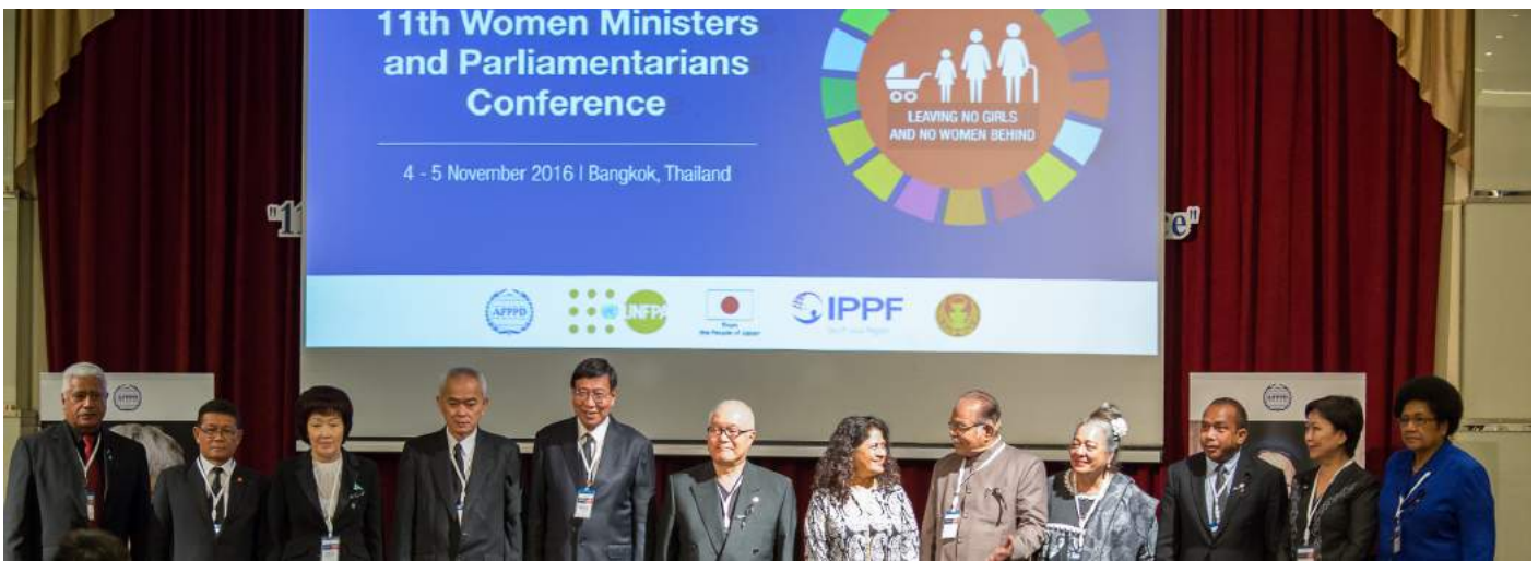
Parliamentary Speakers (Cook Islands, Fiji, Thailand, Timor-Leste, Tonga) and Vice-Speakers (Kazakhstan, India, Thailand), AFPPD Chairperson and Secretary-General, and UNFPA Representative opened the conference, Bangkok, November 2016