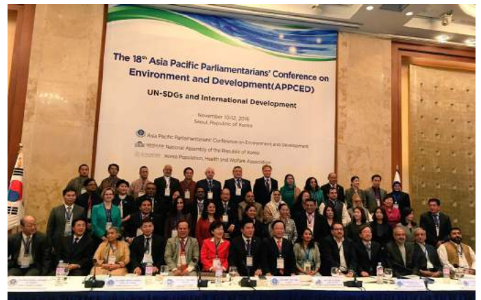
Participants at the 18th General Assembly of APPCED, Seoul, November 2016

APPCED concluded with the adoption of the Seoul Declaration by participating parliamentarians, who committed themselves "to work together and contribute to sustainable development at the Asia-Pacific, as well as international and sub-regional levels."