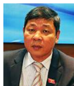
Hon. Mr. Nguyen Hoang Mai Member of Parliament, Vietnam

Committee, the Environment and Climate Change Committee, among others. He strongly supports the Non Communicable Diseases (NCD) campaign in the Pacific. Previously, Hon. Lord Tu'ivakano was elected as Prime Minister in December 2010, following a constitutional reform in which the Prime Minister was elected by the Parliament rather than appointed by the Monarch. In March 2005, he was appointed as Cabinet Minister. From 2002 to 2004, he was appointed as the Speaker of Parliament by His Majesty the King of Tonga.