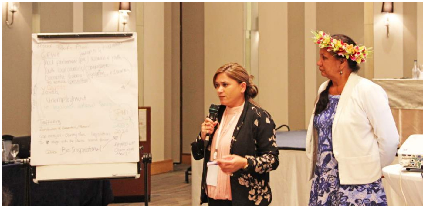
Hon. Ria Bond (Member of Parliament, New Zealand) and Hon. Selina Napa (Member of Parliament, Cook Islands) presented in AFPPD's National Committee Sub-Regional Strategy Meeting on March 23 in Bangkok, Thailand.

South Asian participants discussed a sub-regional common agenda. They included trafficking for forced labour or sexual exploitation, the usage of drugs by the young generation, climate change impacts on all aspects of life, and the negative effects of industrial food on health. Members from South-East Asia identified the following issues to be addressed collectively: gender equality and women's empowerment, advocacy work related