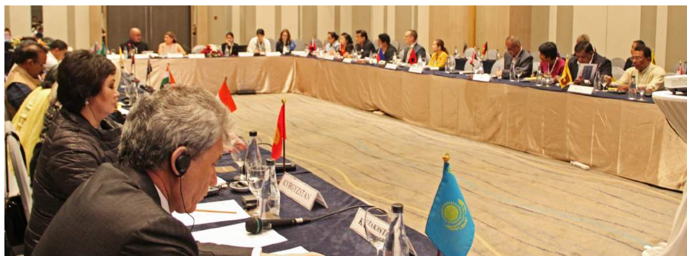
The political participation of women and youth was discussed among AFPPD member parliamentarians at the 2nd Standing Committee Joint Meeting on Gender Equality and Women's Empowerment, and Investing in Youth, on March 23 in Bangkok, Thailand.