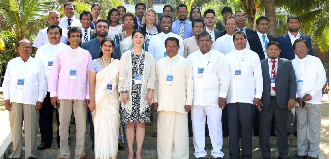
Members of Parliament, Ministers and Government Officials of Sri Lanka, AFPPD Executive Director, Representatives from UNFPA and Family Planning Association of Sri Lanka, at the AFPPD-SLPPD National Inception Workshop on February 16–17, 2017 in Negombo, Sri Lanka.