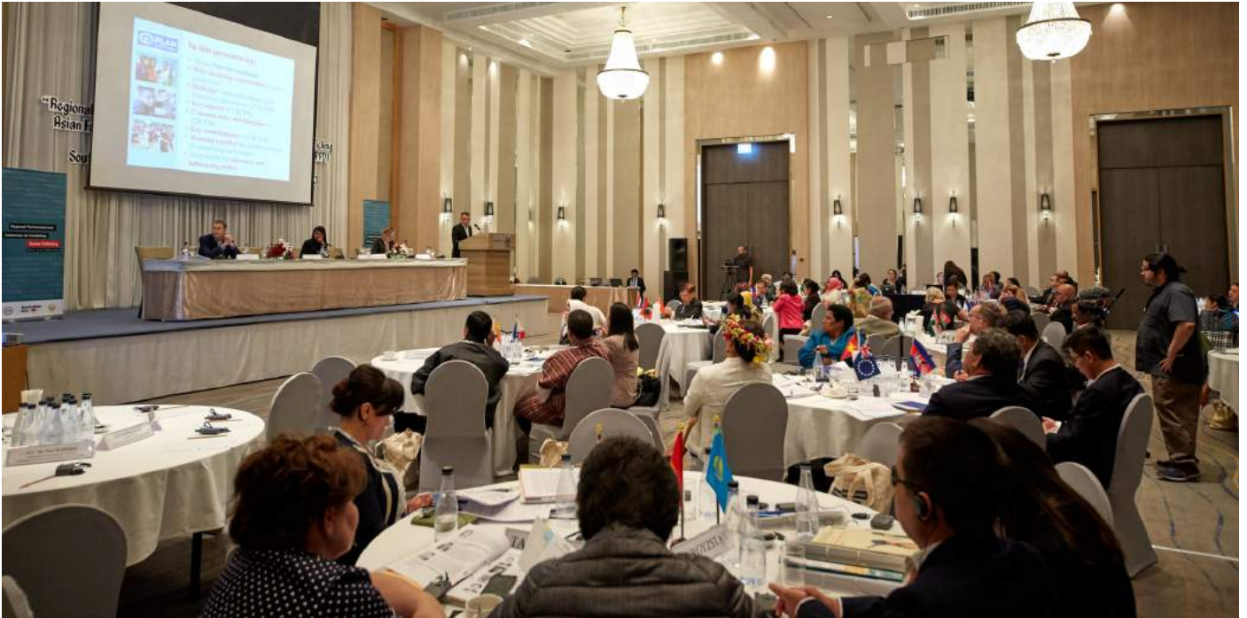
Participating Members of Parliament and representatives of intergovernmental and civil society organizations have adopted the Statement of Commitment to “end human trafficking in all its forms” at the Regional Parliamentarians Conference on Combatting Human Trafficking.

BANGKOK, THAILAND – On March 21-22, over 40 Members of Parliament and 20 experts from 21 Asia-Pacific countries adopted the Statement of Commitment to “end human trafficking in all its forms” at the Regional Parliamentarians Conference on Combatting Human Trafficking in Bangkok. The two-day conference, funded by the Department of Foreign Affairs and Trade (DFAT) of the Government of Australia, was co-organized by the Asian Forum of Parliamentarians on Population and Development (AFPPD) and the South Asian Initiative to End Violence against Children (SAIEVAC), the apex body of the South Asian Association for Regional Cooperation (SARRC).