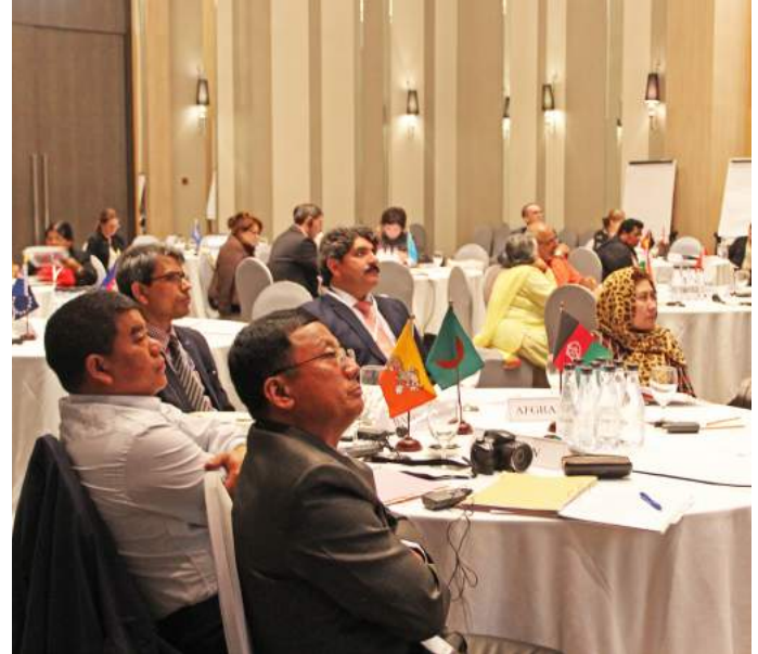
Participating Members of Parliament and representatives of intergovernmental and civil society organizations have adopted the Statement of Commitment to “end human trafficking in all its forms” at the Regional Parliamentarians Conference on Combatting Human Trafficking.

BANGKOK, THAILAND – On March 23, the Asian Forum of Parliamentarians on Population and Development (AFPPD) organized the National Committee Sub-regional Strategy Meeting for its members in Bangkok. The meeting provided participants with a venue to review and re-define their respective national, sub-regional and regional-level advocacy strategies. The members were encouraged to engage in the voluntary national review process of the Sustainable Development Goals (SDGs), particularly the ten AFPPD member countries which will conduct the reviews in 2017: India, Bangladesh, Maldives, Nepal, Afghanistan, Indonesia, Malaysia, Thailand, Japan and Tajikistan