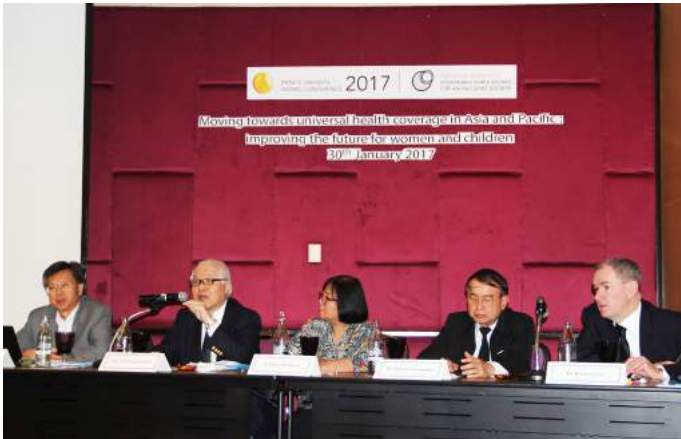
Hon. Professor Keizo Takemi (AFPPD Chairperson and Member of Parliament, Japan) presented in a side event on Japan's Universal Health Coverage experience at the 2017 Prince Mahidol Award Conference on January 30 in Bangkok, Thailand.