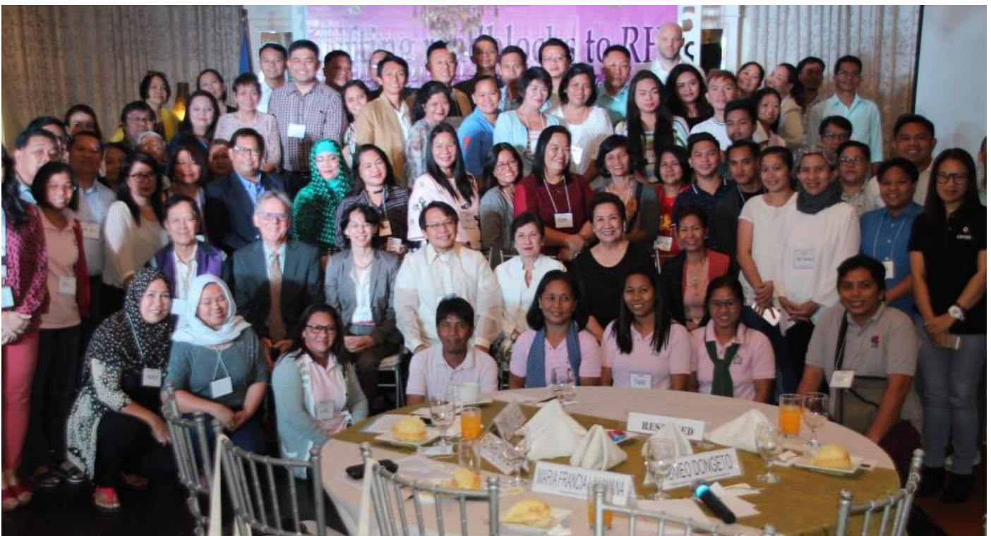
The Annual National Dialogue on SRHR, participated by national and local legislators, advocates, government agencies and health service providers was held last March 28-29, 2017 in Quezon City.