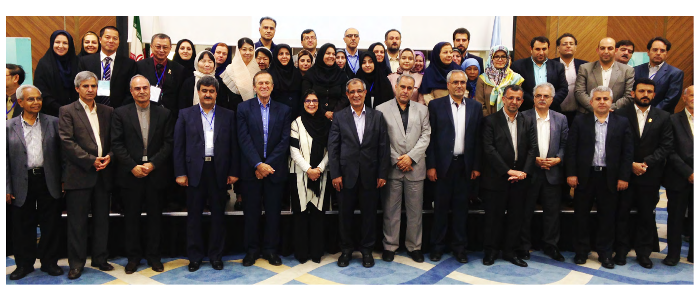
The Regional Forum on Policy Implications of Population Ageing welcomed 30 experts from 15 countries as well as 70 participants from various organizations in Iran to address ageing issues in Asia-Pacific.

TABRIZ, IRAN – On July 3–5, the Asian Forum of Parliamentarians on Population and Development (AFPPD) participated in the Regional Forum on Policy Implications of Population Ageing in Tabriz, Iran. Organized by the United Nations Population Fund (UNFPA) and HelpAge International, in collaboration with the Ministry of Cooperatives, Labour and