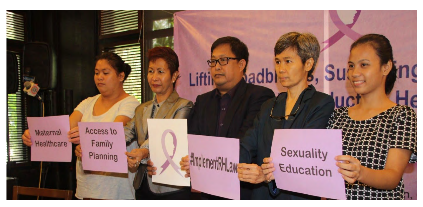
Filipino advocates launched #ImplementRH to address the challenges concerning the implementation of the Responsible Parenthood and Reproductive Health Law.

QUEZON CITY AND ALBAY, PHILIPPINES – Filipino advocates have launched a series of activities to expand the discussion on the Responsible Parenthood and Reproductive Health (RPRH) Law under the title, "#ImplementRH." This action followed the Supreme Court's statement on May 2017 which denied the government's motion to lift the temporary restraining order on contraceptive implants. The series aims to address the challenges to the implementation of the RH Law, preparing for the upcoming congressional review and oversight of the law.