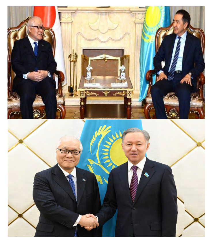
Above: Hon. Professor Keizo Takemi, AFPPD Chairperson and MP, Japan, met with H.E. Prime Minister. Bakhytzhan Sagintayev, during a consultation visit in the Republic of Kazakhstan. Below: Hon. Professor Takemi also met with Hon. Chairman Nigmatulin

Nurlan of the Mazhilis Parliament (lower house) during the same visit in Kazakhstan.