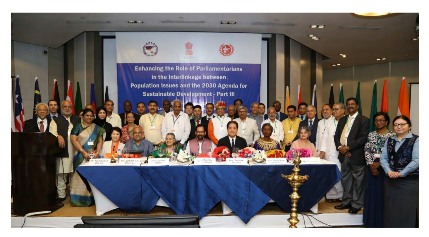
Parliamentarians from 18 Asia-Pacific and African countries met to discuss the role of parliamentarians in the 2030 Agenda for Sustainable Development on September 13–15, 2017, in New Delhi, India.

IAPPD is the member National Committee of AFPPD in India. APDA is the Secretariat of the Japan Parliamentarians Federation for Population (JPFP), the member National Committee of AFPPD in Japan.