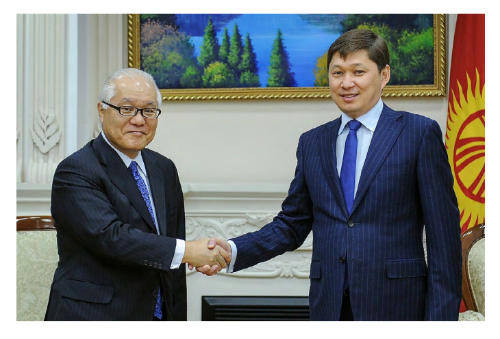
The AFPPD delegation led by Hon. Professor Keizo Takemi, AFPPD Chairperson met H.E. Prime Minister Sapar Isakov to discuss health issues.

The AFPPD delegation conducted meetings with relevant ministers on the possibility for Kazakhstan and AFPPD to co-organize a youth conference in 2018.