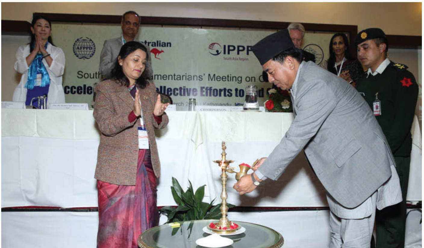
Lighting Ceremony by Vice President of Nepal Rt. Hon. Nanda Bahadur Pun Pasang, with Hon. Ms. Dina Mahalaxmi Upadhyay, MP Nepal