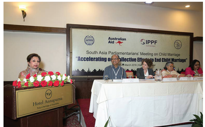
Hon. Mahtab Akbar Rashdi, MP Pakistan, shares a case study on child marriage