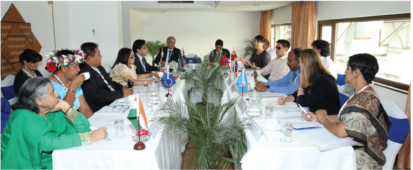
First Joint Standing Committees' Meeting on Gender Equality and Women's Empowerment and on Investing in Youth