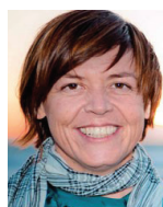
Hon. Ms. Jan Logie Member of Parliament, New Zealand Representing Hon. Barbara Kuriger, Co-chair of the Standing Committee on Gender Equality and Women's Empowerment