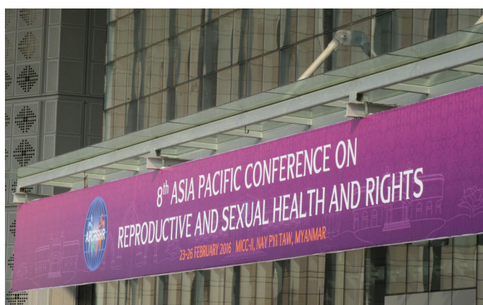
Welcome banner at the 8th APCRSHR Conference venue