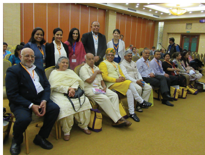
Conference participants: representatives from IPPF, AFPPD, UNFPA and members of parliaments from India, Nepal, Maldives, and Pakistan