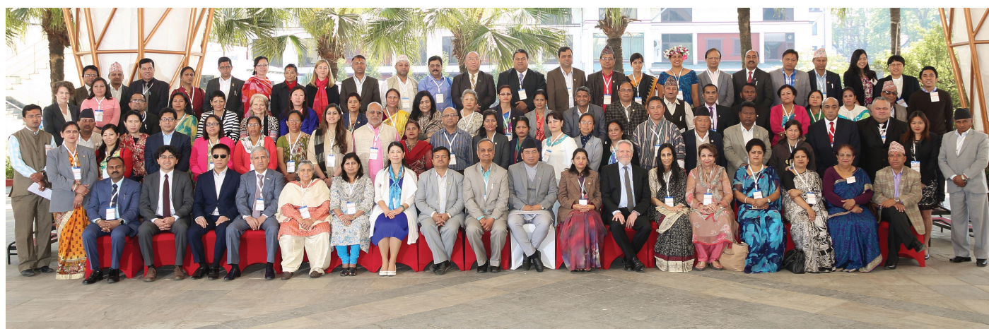
In total, 63 Asia-Pacific MPs and 32 experts and stakeholders gather at the Child Marriage Meeting in Kathmandu