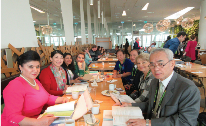
The AFPPD delegation during a briefing meeting on May 16.