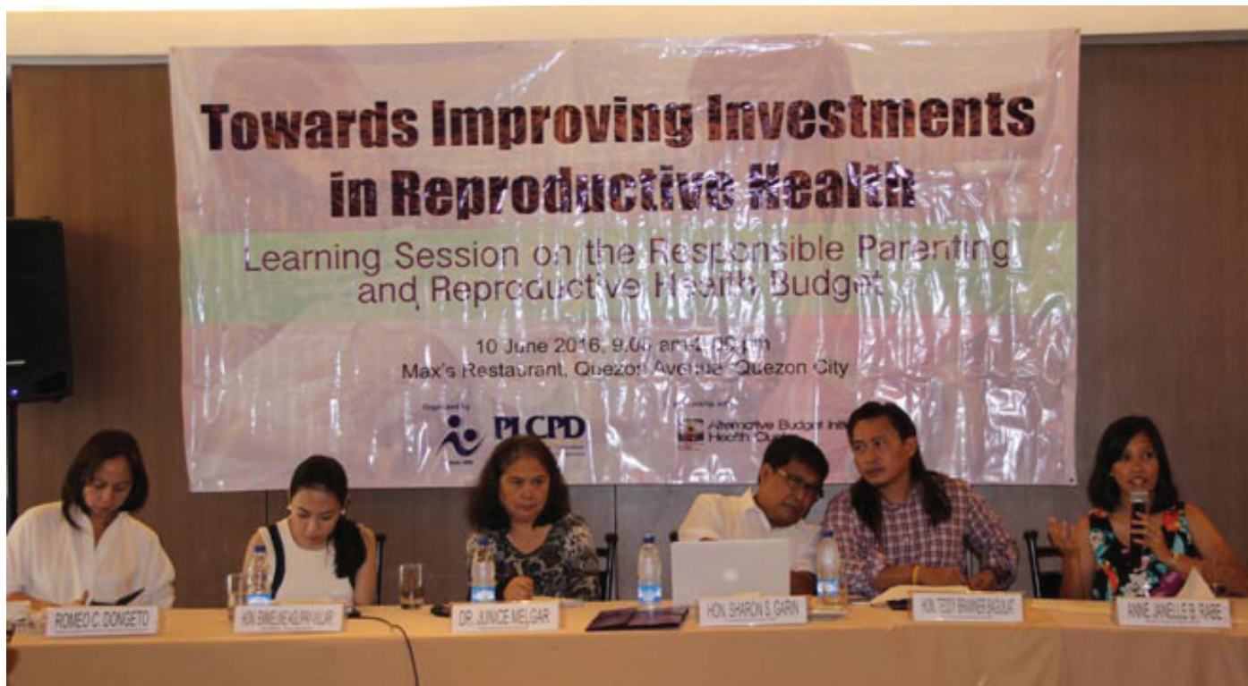
Panellists of the Learning Session on Responsible Parenting and Reproductive Health Budget .

QUEZON CITY, PHILIPPINES — On 20 June 2016, the Philippine Legislators' Committee on Population and Development (PLCPD) convened representatives from the legislative and executive branches of the Philippine government, civil society organizations, and faith-based institutions for a multi-sector discussion. They focused on how to adequately monitor and defend the budget for implementing the Responsible Parenthood and Reproductive Health (RPRH) Law in preparation for the upcoming deliberation of the proposed 2017 General Appropriations Act. PLCPD organized the learning session titled "Improving Investments in Reproductive Health - A Learning Session on the Responsible Parenting and Reproductive Health Budget" to inform various stakeholders on the progress of the implementation of the RPRH Law and to create a venue where the stakeholders can share ideas to ensure the budget for implementing the Law.