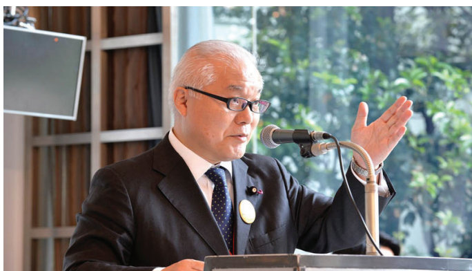
Hon. Professor Keizo Takemi welcoming the participants to the Global Conference on Population and Development (GCPPD) in Tokyo, Japan.