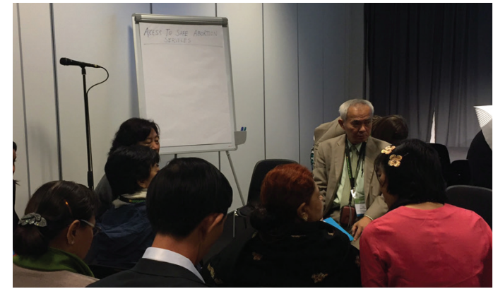
Hon. Dr. Jetn Sirathranont co-facilitating a working group on the topic of access to safe abortion services.

Hon. Dr. Sharman Stone (Australia) delivered opening remarks representing the AFPPD, sharing her advocacy work at home and abroad for promoting women's and girls' rights. She also launched the AFPPD's new publication Parliamentary Good Practices for Effective Implementation of Laws and Policies for Prevention of Trafficking , funded primarily by the Department of Foreign Affairs and Trade of the Australian Government.