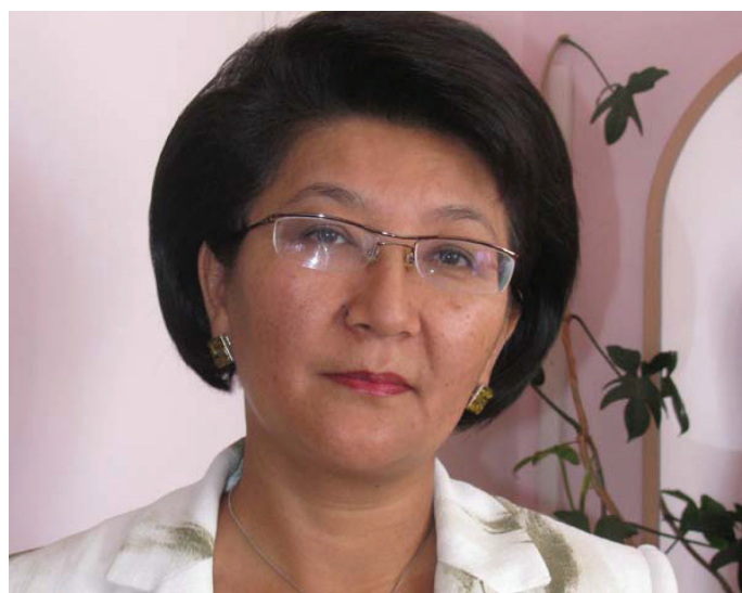
Hon. Ms. Taalaykul Isakunova, MP Kyrgyzstan.

The newly drafted legislation outlines the roles and responsibilities of various government and judicial bodies, the media and civil society for safeguarding and protecting victims from domestic violence.