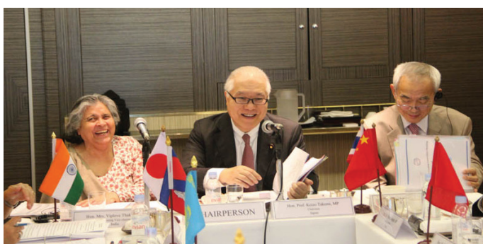
(L-R): Hon. Viplove Thakur, Hon. Professor Keizo Takemi, and Hon. Dr. Jetn Sirathranont.