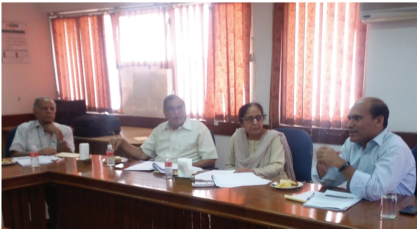
IAPPD Technical Advisory Committee members discussing the Content Analysis Report during the TAC Meeting.