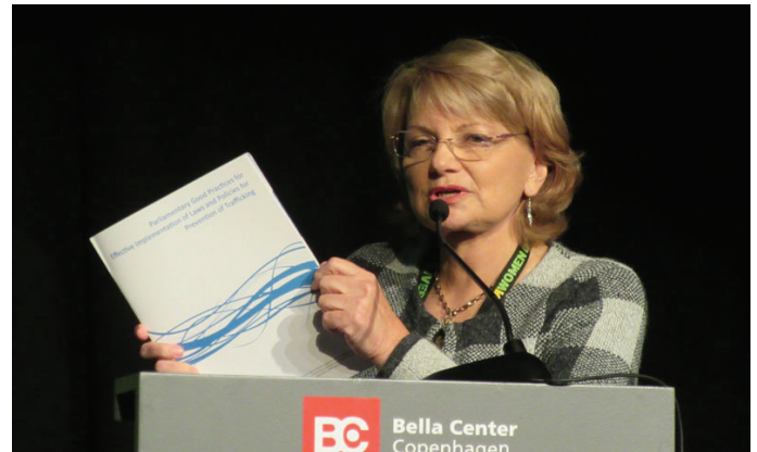
Hon. Dr. Sharman Stone introducing and launching the AFPPD's new publication on parliamentary good practices for prevention of trafficking.