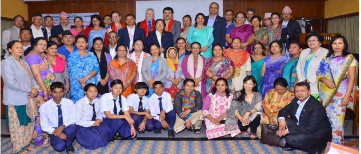
Participants of advocacy workshop on “Investing in Teenage Girls” with parliamentarians, Kathmandu, July 2016