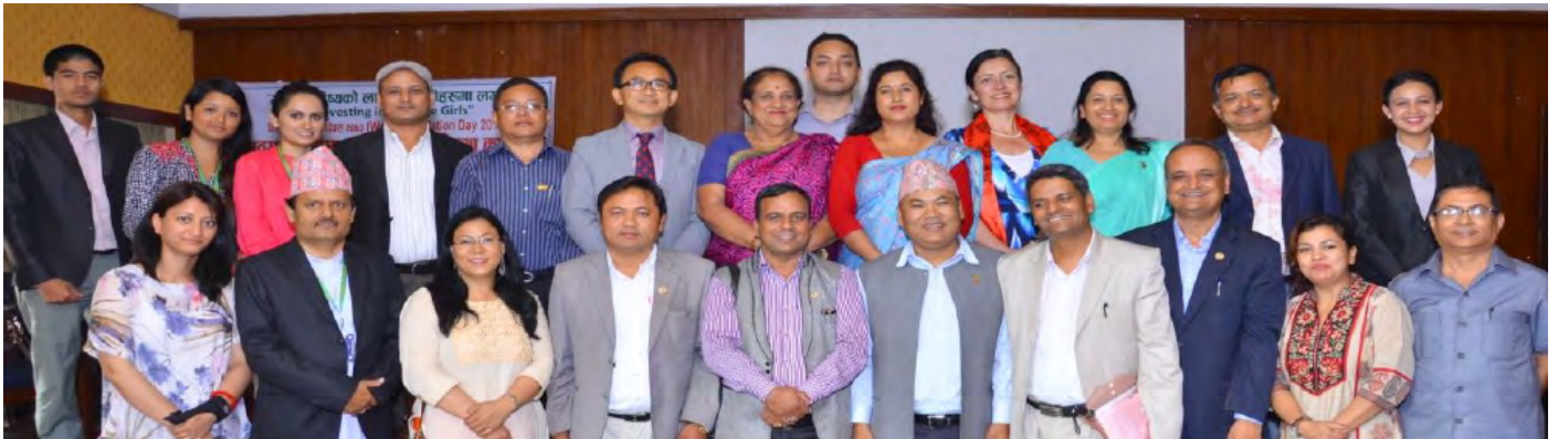
The workshop held on the occasion of World Population Day, Kathmandu, July 2016