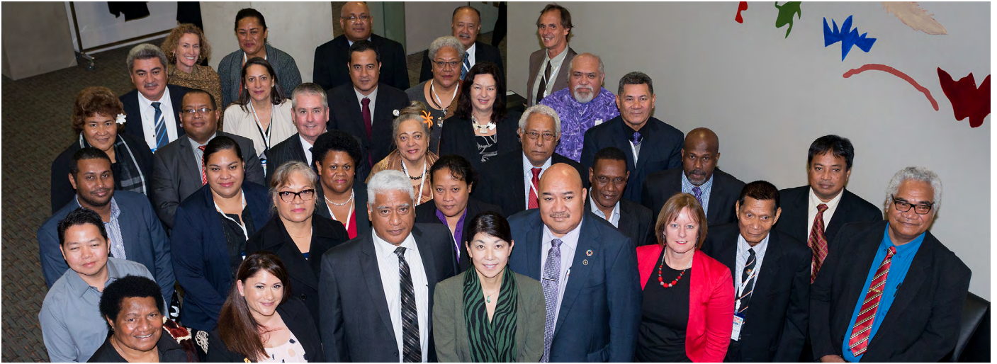
The AFPPD-NZPPD Workshop participants including parliamentary leaders from 9 Pacific nations and experts, Wellington, September 2016