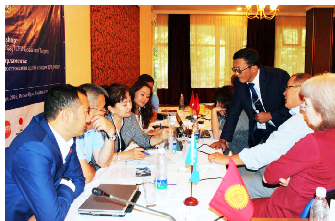
Participants engaged in a workshop exercise, Issyk-Kul, September 2016

ISSYK-KUL, KYRGYZSTAN - On 2-3 September 2016, the Asian Forum of Parliamentarians on Population and Development (AFPPD) held a workshop on “Legislating for the Full Achievement of the SDGs/ICPD Goals and Targets” in Issyk-Kul, Kyrgyzstan. The National Committee of Kyrgyzstan on Population and Development (NCKPD), the AFPPD member in the country, hosted the workshop. Attendees included 13 Members of Parliament; the Deputy Director of the State Agency on Youth Policy of Kyrgyz Republic; two representatives of the National Statistics Committee; UNFPA representatives in Kyrgyzstan; the Executive Director of Kyrgyz Alliance on Reproductive Rights; and the Parliament office staff.