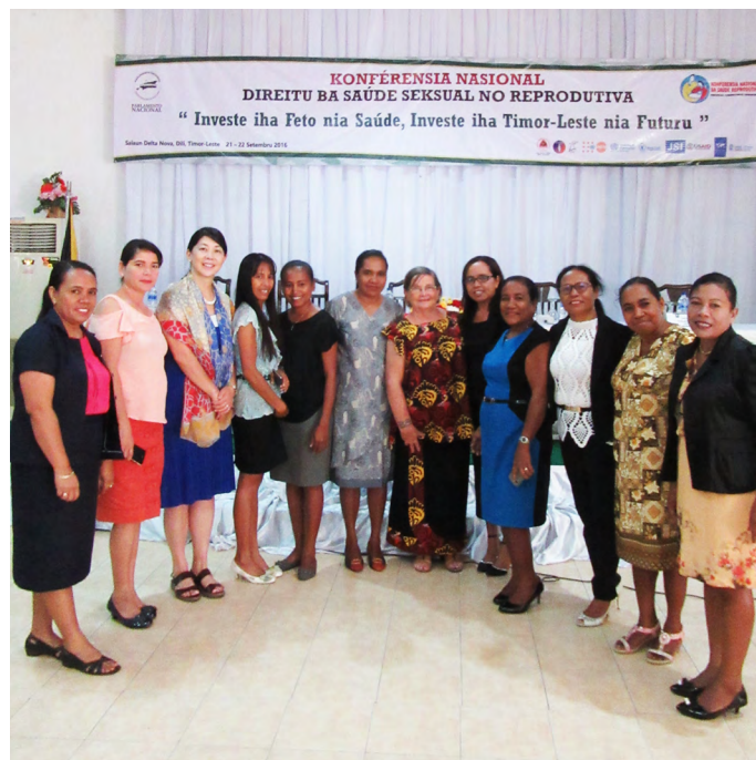
Participants at the GMPTL National Conference

of Discrimination Against Women (CEDAW) Concluding Observations for Timor-Leste . The recommendations will be incorporated into the Road Map for Action for 2016-2019 . During the final session of the conference, the recommendations were endorsed by the participants and submitted to the representatives of the Timor-Leste Government for further actions.