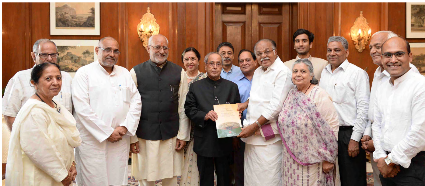
IAPPD submitted the report "Content Analysis of Parliamentary Questions of Both Houses of Parliament (2014-2016)" to the Honourable President of India, New Delhi, September 2016

NEW DELHI, INDIA – The Indian Association of Parliamentarians on Population and Development (IAPPD) recently submitted a report "Content Analysis of Parliamentary Questions of Both Houses of Parliament (2014-2016)" to the Honourable President of India, Shri Pranab Mukherjee. Hon. Professor P.J. Kurien, Deputy Chairman of the Upper