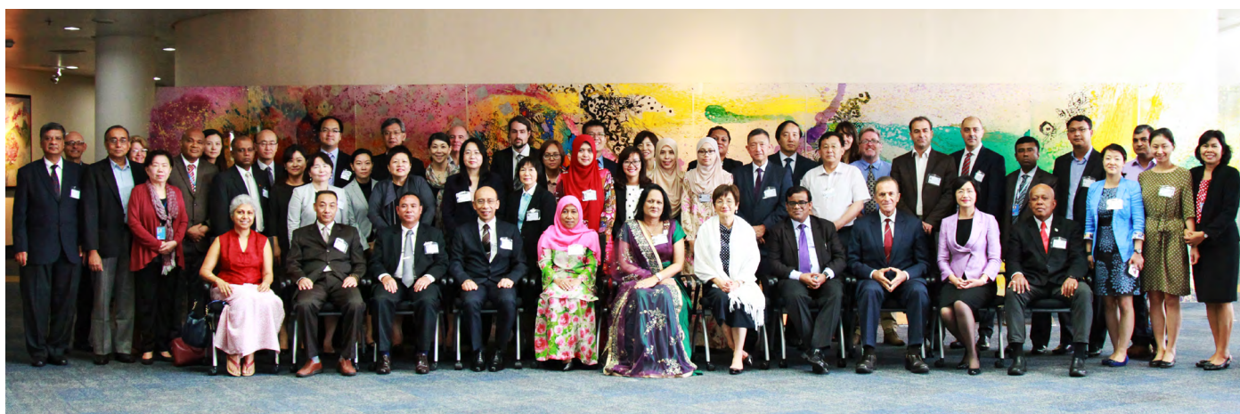
Participants at the Regional Experts Forum on Population Ageing including government focal points on ageing, policy makers, and representatives from UN and CSOs, Bangkok, July 2016

BANGKOK, THAILAND – The Asian Forum of Parliamentarians on Population and Development (AFPPD) attended the Regional Experts Forum on Population Ageing, which was organized by the United Nations Economic and Social Commission for Asia and the Pacific (UNESCAP) and the National Health and Family Planning Commission of China (NHFPCC) on 12-13 July 2016 in Bangkok, Thailand. The Forum was attended by government focal points on population ageing, policymakers from many of the AFPPD member countries, development practitioners, independent experts and civil society experts such as HelpAge International.