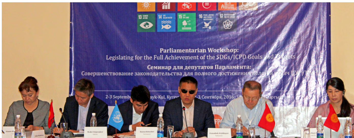
Workshop on “Legislating for the Full Achievement of the SDGs/ICPD Goals and Targets,” Issyk-Kul, September 2016

ISSYK-KUL, KYRGYZSTAN - On 2-3 September 2016, the Asian Forum of Parliamentarians on Population and Development (AFPPD) held a workshop on “Legislating for the Full Achievement of the SDGs/ICPD Goals and Targets” in Issyk-Kul, Kyrgyzstan. The National Committee of Kyrgyzstan on Population and Development (NCKPD), the AFPPD member in the country, hosted the workshop. Attendees included 13 Members of Parliament; the Deputy Director of the State Agency on Youth Policy of Kyrgyz Republic; two representatives of the National Statistics Committee; UNFPA representatives in Kyrgyzstan; the Executive Director of Kyrgyz Alliance on Reproductive Rights; and the Parliament office staff.