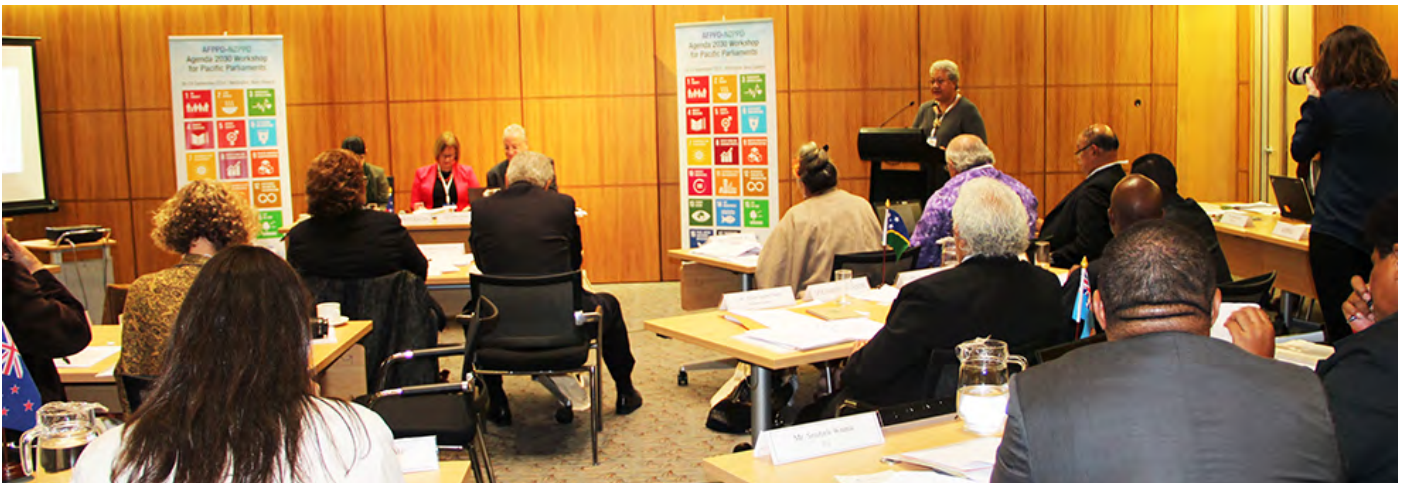
Hon. Ms. Fiaame Naomi Mata'afa, Deputy Prime Minister of Samoa and Minister for Natural Resources and the Environment, presenting at the AFPPD-NZPPD Agenda 2030 Workshop in Wellington, September 2016