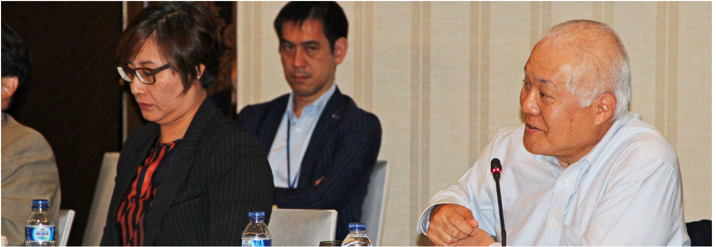
AFPPD Chairperson, Hon. Professor Keizo Takemi presented at the 14th Asian Statesmen Forum, Jakarta, August 2016

JAKARTA, INDONESIA - On 27-28 August 2016, the Asian Forum of Parliamentarians on Population and Development (AFPPD) attended the 14th Asian Statesmen Forum (ASF) organized by the National Graduate Institute for Policy Studies (GRIPS) of Japan. Over 35 attendees were present including political leaders from Indonesia, Malaysia, Thailand and Japan.