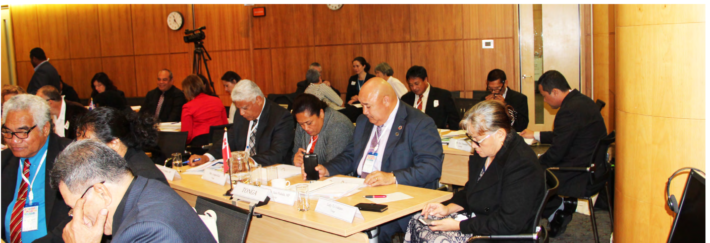
Participants engaged in a group work exercise on data availability and access in Wellington, September 2016