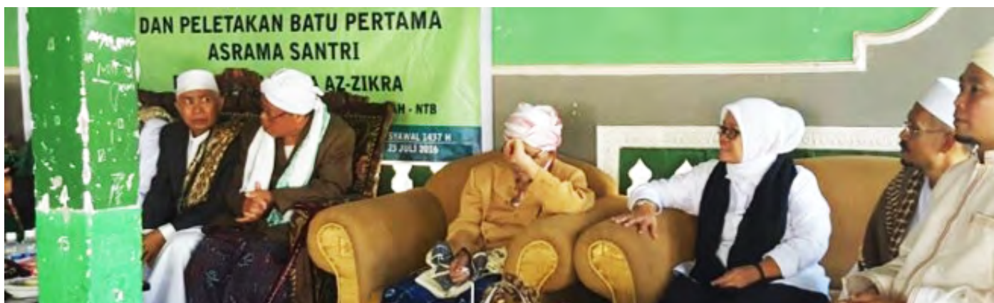
Hon. Ms. Ermalena Muslim Hasbullah engaged local religious leaders in Nusa Tenggara Barat to actively address public health issues