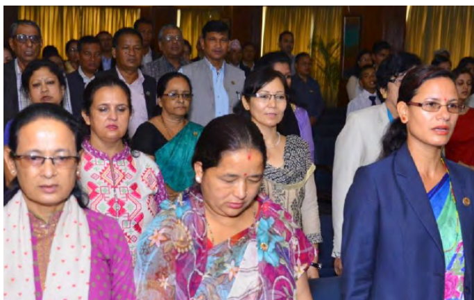
Participants at the opening ceremony of the workshop, Kathmandu, July 2016