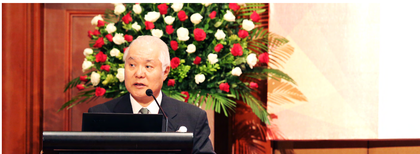
AFPPD Chairperson, Hon. Professor Keizo Takemi, delivered the keynote speech at the HelpAge Asia-Pacific Regional Conference, Hanoi, September 2016