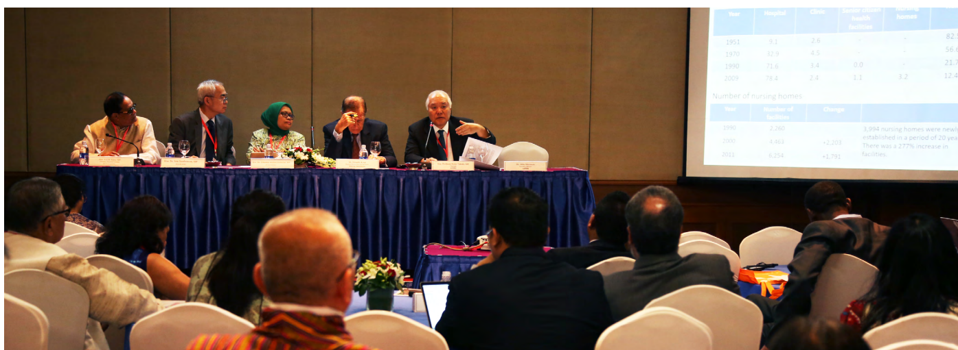
Special Session on the role of parliamentarians in creating active ageing societies was co-chaired by AFPPD and HelpAge International, Hanoi, September 2016