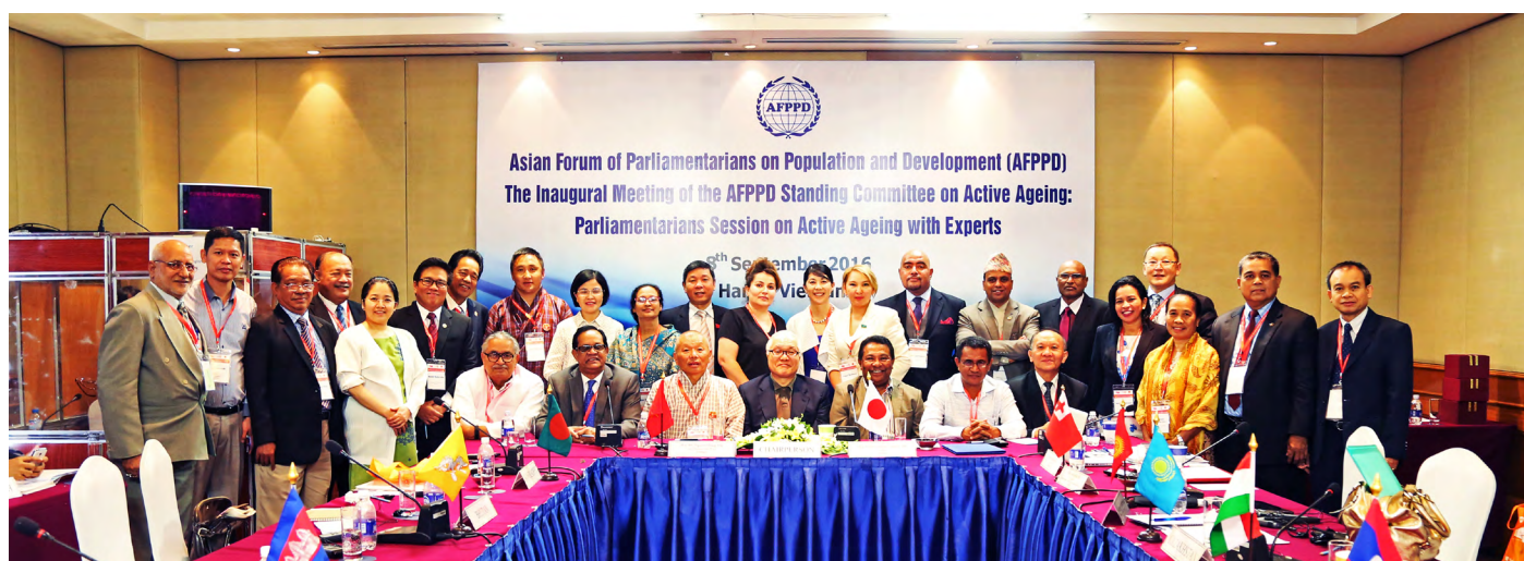
AFPPD Inaugural Standing Committee Meeting on Active Ageing, Hanoi, September 2016

HANOI, VIETNAM - On September 8, AFPPD held its inaugural Standing Committee Meeting on Active Ageing in Hanoi, Vietnam with experts from the National Institute of Population and Social Security Research (Japan), the United Nations Economic and Social Commission for Asia and the Pacific (UNESCAP), the World Health Organization (WHO), HelpAge International, the United Nations Population Fund (UNFPA) and the Asian Development Bank (ADB).