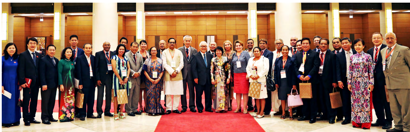
AFPPD delegation of parliamentarians during their study visit to the Vietnamese National Assembly, Hanoi, September 2016