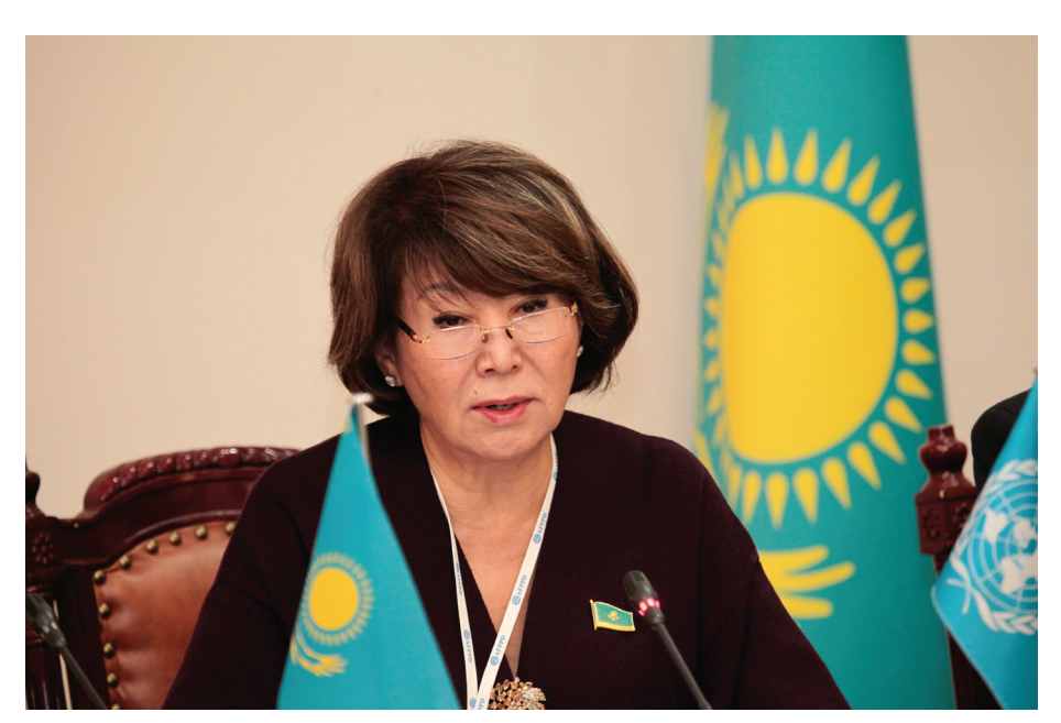
Hon. Mme. Aitkul Samakova, MP, Kazakhstan, and Vice-Chair, AFPPD

On 12-13 November 2015, the Asian Forum of Parliamentarians on Population and Development (AFPPD) convened a workshop on "Legislating for the Full Achievement of the SDGs/ ICPD Goals and Targets," focusing on Kazakhstan. The workshop was cohosted by the Social Council under the Nur Otan Party in the Lower House of the Parliament of Kazakhstan. The Social Council is chaired by Hon. Mme. Aitkul Samakova, Member of Parliament (MP) and Vice-Chair of the AFPPD. The main goal of the workshop was to better inform MPs on SDGs and the ICPD agenda focusing on national priorities. In total, 26 participants attended the workshop, including 13 MPs, 5 government officials, three parliament staff, two CSO representatives, and UNFPA and UNESCO representatives.