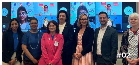
#01 Picture of participants during the session of conference in Kigali #02 Participants of conference held in Australia. #03 During the conference.

AUSTRALIA - 15 NOVEMBER 2023 - The Australian Parliamentary Group on Population and Development (APGPD) and member of AFPPD, hosted a key event at Parliament House in partnership with Plan International and ActionAid, underlining its commitment to global issues. This proactive engagement within the AFPPD exemplifies the commitment of Australian parliamentarians to advancing sustainable development and gender equality on a global scale.