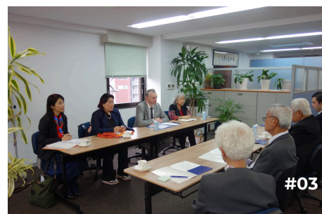
#01 Participants of ExCom #02 During the ExCom #03 During the courtesy visit