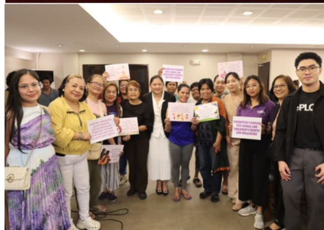
Pictured from top to bottom: the Press Conference and the Consultative Budget Forum.